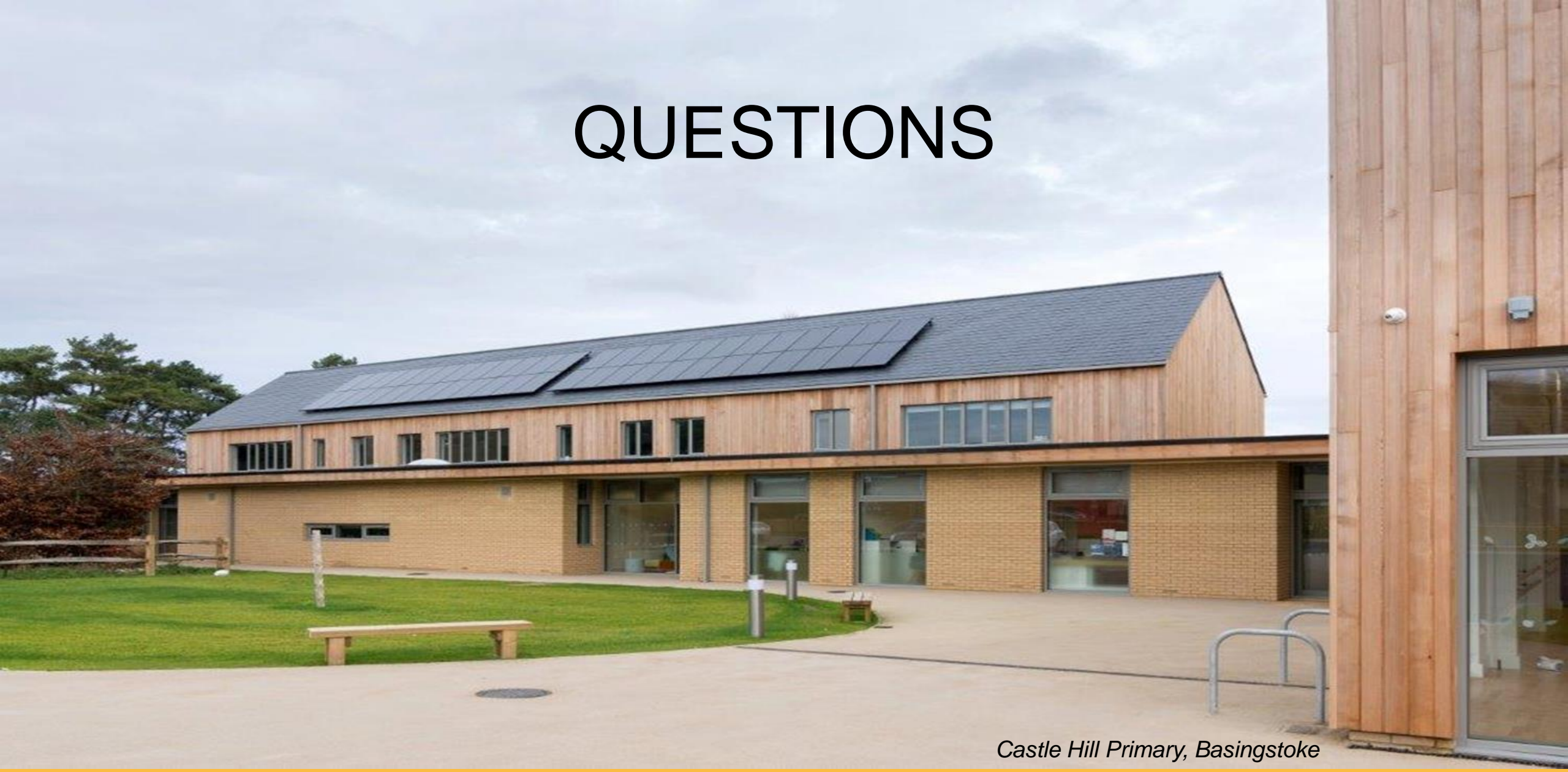
Castle Hill Primary, Basingstoke