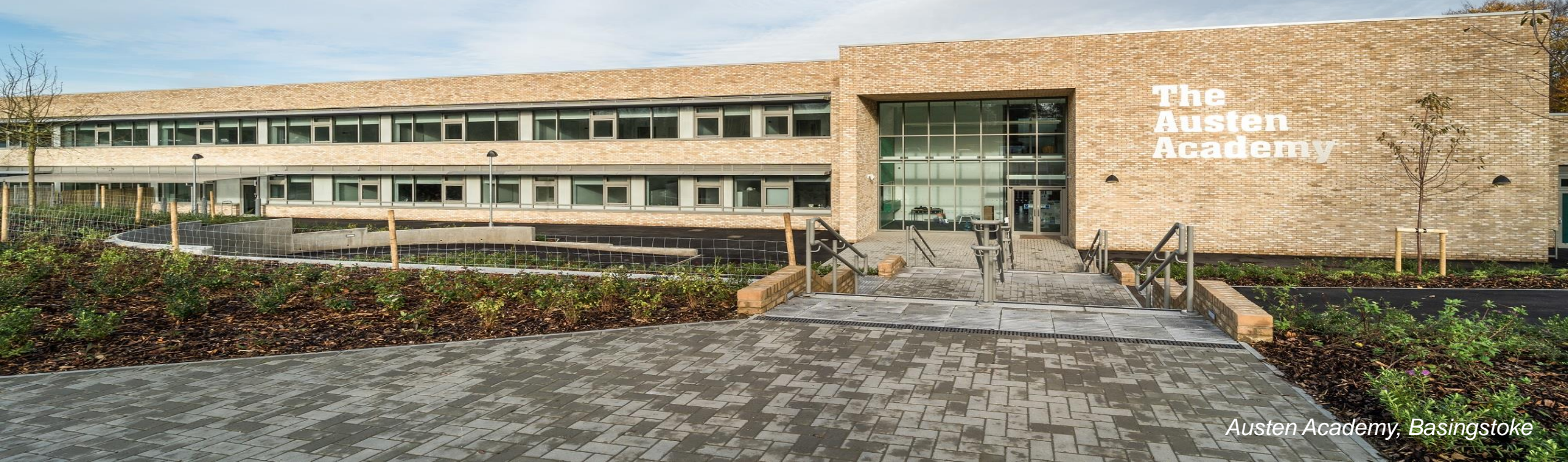
Austen Academy, Basingstoke