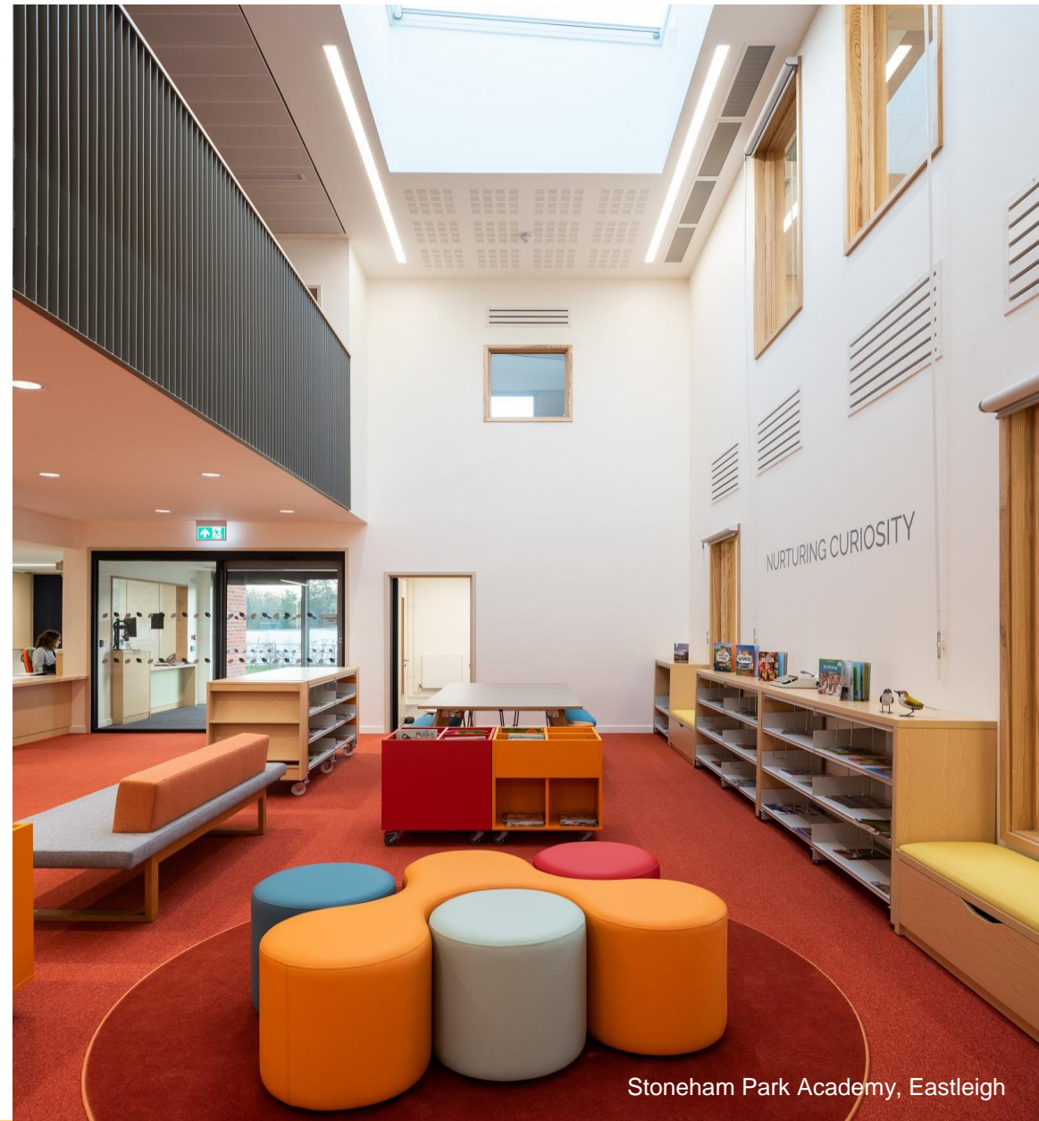
Stoneham Park Academy, Eastleigh